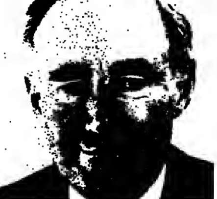
ALLEGED SPY: The photo shows Sir Roger Hollis, a former head of MI5, for Germany after 1940 or for the Soviets following the war. But his interrogators believed he acted as an agent for the Nazis

LONDON, March 26 (AP) — Britain's No. 3 intelligence officer at the end of World War II allegedly acted as an agent for Nazi Germany and later for the Soviet Union, The Daily Mail reports in its latest spy expose. In an article published in Thursday's editions, defense specialist Chapman Pincher wrote that Charles Howard "Dick" Ellis was believed to have cooperated with Britain's enemies for nearly 30 years. Ellis was a career intelligence officer best known for his wartime service as second in command to Sir William Stephenson, who headed joint British-U.S. intelligence in New York during World War II. Pincher wrote that in 1965 Ellis made an "abject confession" to spying for Germany up to 1940, before Britain entered the war, and admitted to handing over detailed charts of British intelligence knowing that they would go both to Germany and the Soviet Union. Ellis died in 1975 at the age of 80. The Mail said Ellis did not admit to spying